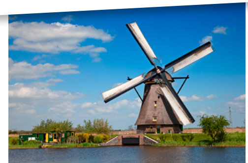
Wind mill, The Netherlands