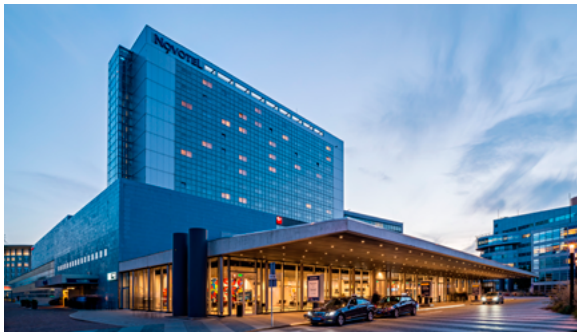
World Forum