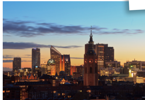
Skyline, The Hague